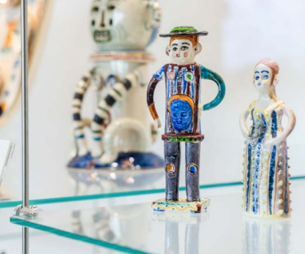
Stephen Bird: Industrial Sabotage