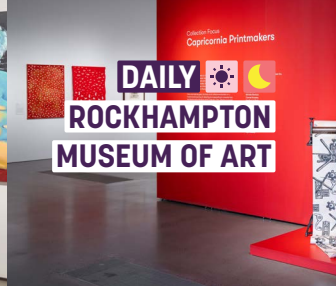
Collection Focus: Capricornia Printmakers